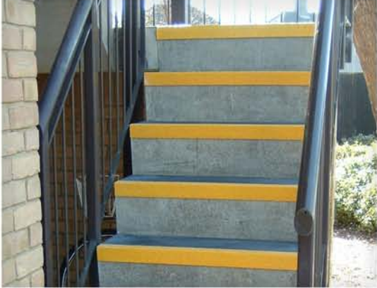
Before Uncovered concrete riser.

PROTECT AND ENHANCE YOUR CURRENT STAIRCASES WITH RISER PLATES